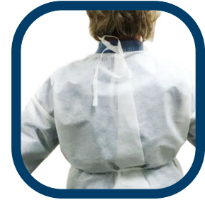
Neck and Waist Tie