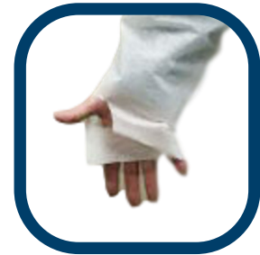
Sleeve Thumb Holes